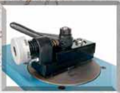
Shown with optional flange attachment